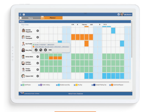
Employees can enter leave via the Self Service module ready for approval by their Manager.